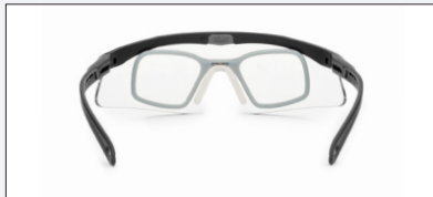
OPTIONAL RX CARRIER