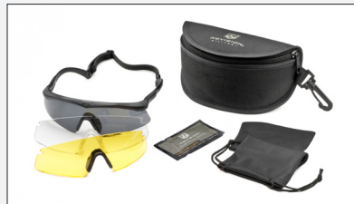
SAWFLY DELUXE KIT